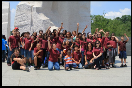
H.P.C.A. students at the Martin Luther King, Jr. Memorial

On Friday May 25th our sixth, seventh, and eighth grade students took an educational field-trip to Washington D.C.