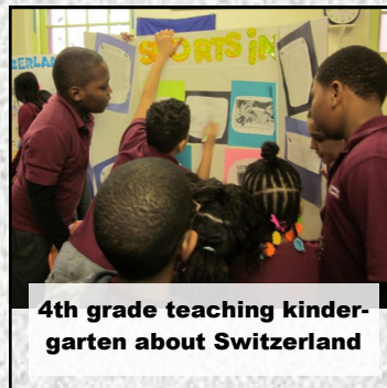
4th grade teaching kindergarten about Switzerland