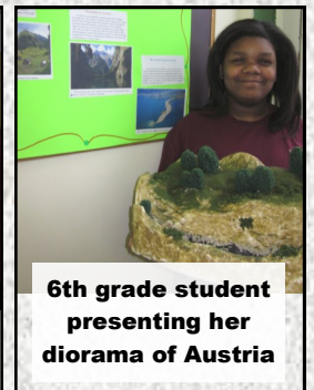
6th grade student presenting her diorama of Austria