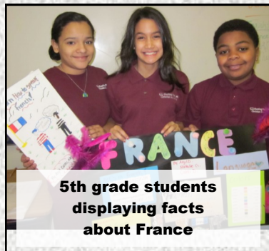
5th grade students displaying facts about France