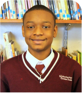
Student Council President