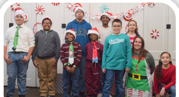
Taking a break during the Christmas store

So far, the student council has coordinated a mock election in November, helping students cast their votes for different presidential candidates. Also in November, they planned a Harvest Festival, which included carnival-type games and scarecrow building. In December, they organized a Christmas store, giving students a chance to buy gifts and do a Christmas craft. They are currently working on Love Your Neighbor Day, which will include a fundraiser for a neighborhood ministry and a neighborhood clean-up. In May, they will be responsible for Theme Week, with different activities every day.