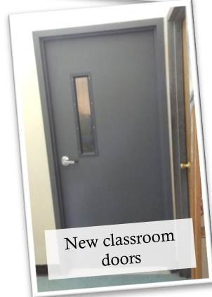
New classroom doors

To get the true impact of all this growth, it is best to see it in person. We would love to host you! You are welcome any time, or you can attend a scheduled tour during a school day. Be on the lookout for specific tour dates. If you cannot be here physically, there are still many ways that you can be a part of HPCA. Would you prayerfully consider how you might partner with us to produce even greater growth in our community? Thank you!