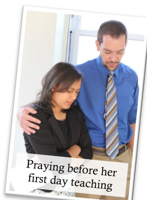
Praying before her first day teaching