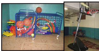
Some of the new gym equipment purchased using a $10,000 grant from St. Christopher's Foundation for Children.