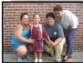
A new Pre-K family on the first day of school!