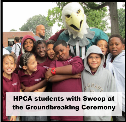
HPCA students with Swoop at the Groundbreaking Ceremony

We are thrilled to see the changes to our community and excited to hold future Races for Education in Hunting Park!