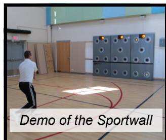
Demo of the Sportwall

In December 2011, Esperanza Health Center opened a new facility across the street from HPCA. It is a community-based, non-profit health center that provides affordable, quality, bilingual primary health services in Jesus' name, without regard to an individual's ability to pay. Esperanza serves approximately 8,600 patients in their three locations. At the Hunting Park location, in addition to offering health care, Esperanza offers a healthy café, Zumba and kickboxing classes, and family cooking classes for the community.