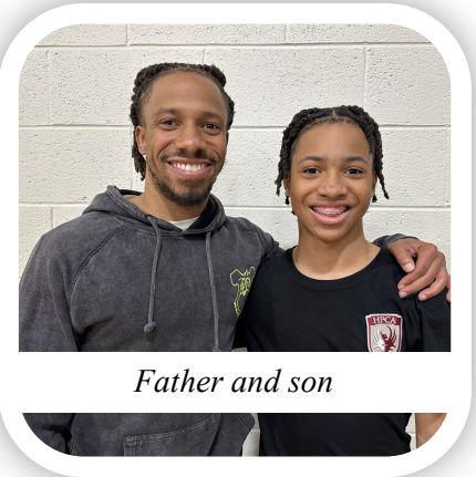
Father and son

As soon as your child enrolls in HPCA, they become part of a large, happy family. The school's staff genuinely cares for all students, extending themselves beyond school hours to ensure every student achieves their full potential. Guided by God's hands, the school is committed to making disciples of Christ and serving the community. As a parent and HPCA alumnus, I thank God for this school and the love it exudes. I pray that God continues to bless this school for years to come. May God bless you, and I love you all for the sake of our Lord and Savior, Jesus Christ.