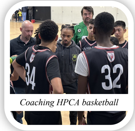
Coaching HPCA basketball