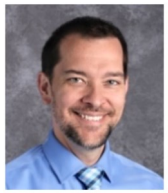
by Kevin Deane, Principal

The city does not need the sun or the moon to shine on it, for the glory of God gives it light, and the Lamb is its lamp. - Revelation 21:23