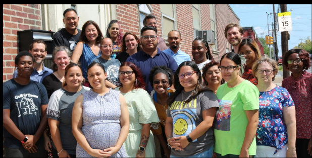
OUR 2023-2024 HPCA STAFF