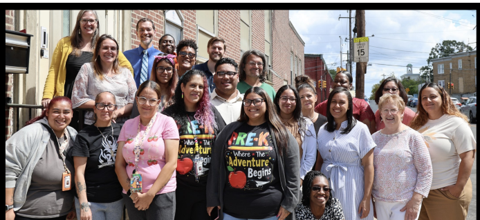
2025-2026 HPCA STAFF