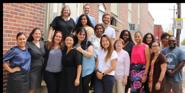
OUR 2019-2020 HPCA STAFF