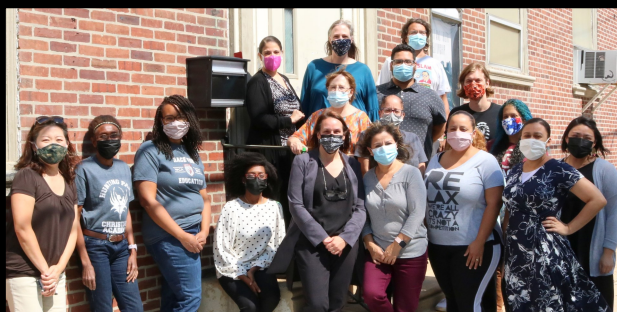
OUR 2021-2022 HPCA STAFF